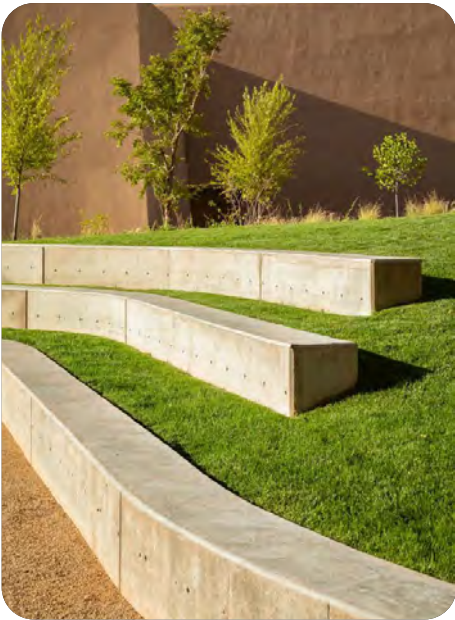
Stone-like Terrace Lawn Seating Steps