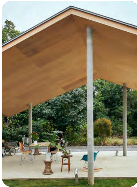
New Shade Inspired by Historic Structures