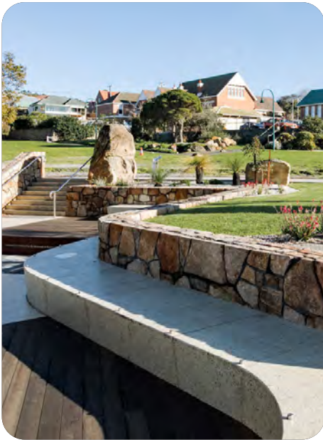
Stone and Concrete Seating