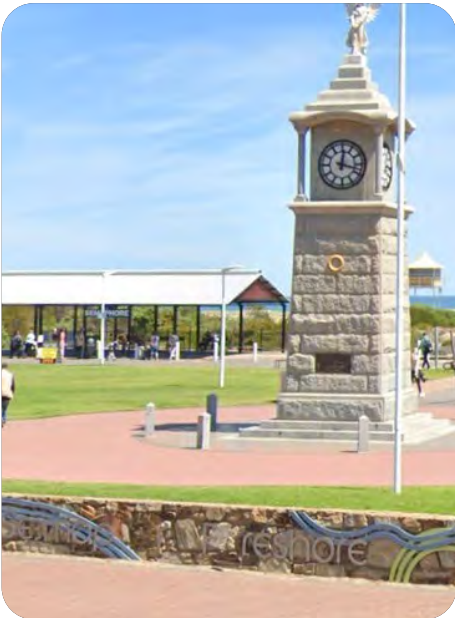
Semaphore Feature Signage Wall