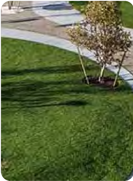
Generous Open Lawn