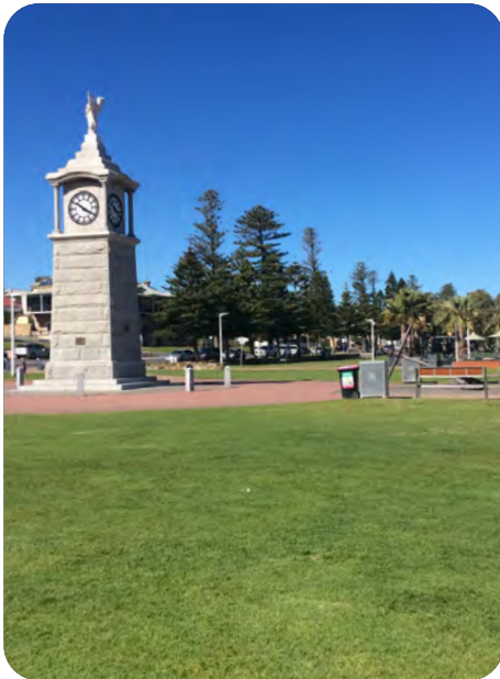
Generous Lawn Space