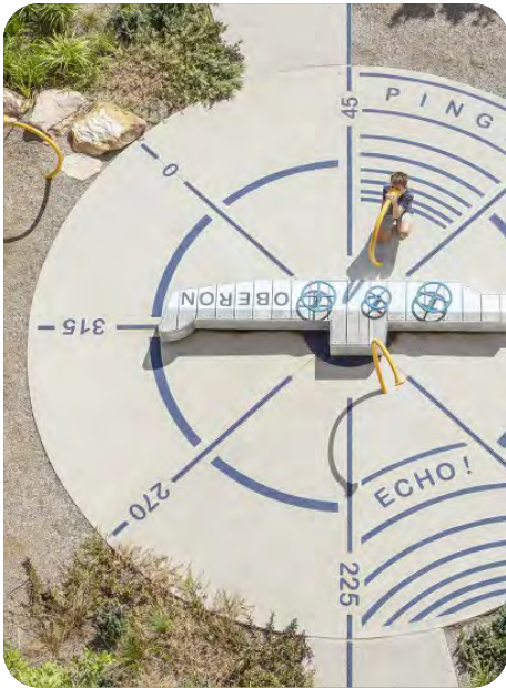
Signage and Interpretation