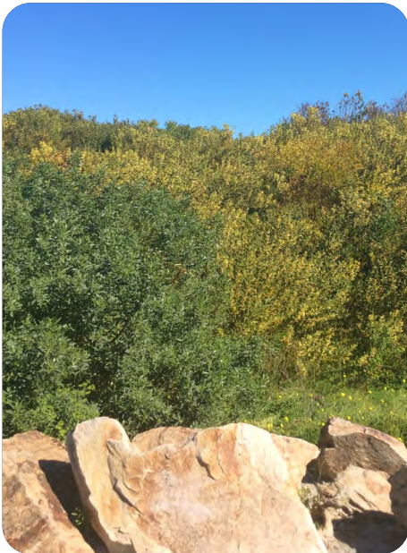
Dunes and Sandstone Wall