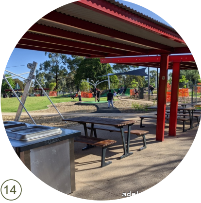
14 New Gateway Plaza with Feature Gardens and Artwork