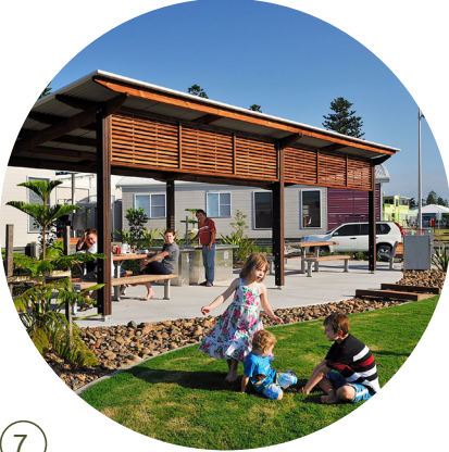
7 Congregation nodes with Shelter, Benches and BBQs