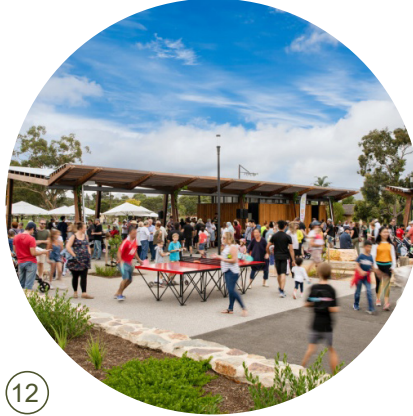
12 Long Shelter with Picnic Settings, BBQs and Table Games