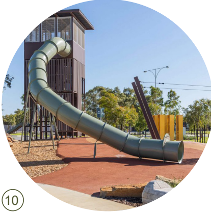
10 Train Themed Youth Playspace