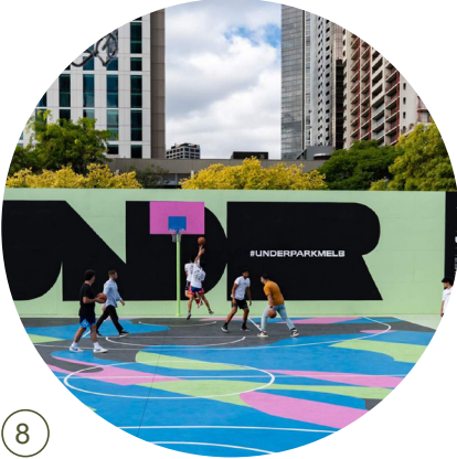
8 Upgraded and Resurfaced Existing Court with Artwork