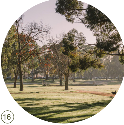
16 Passive Recreation Area with Irrigated Lawns and Trees