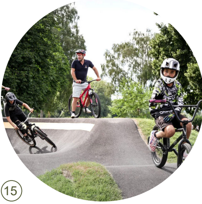
15 Bitumised Pump Track