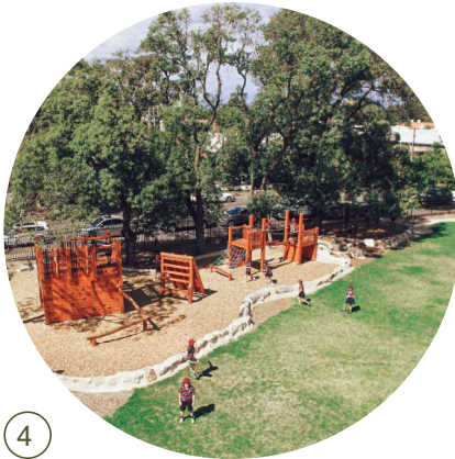
4 Natureplay Area with Natural Shade