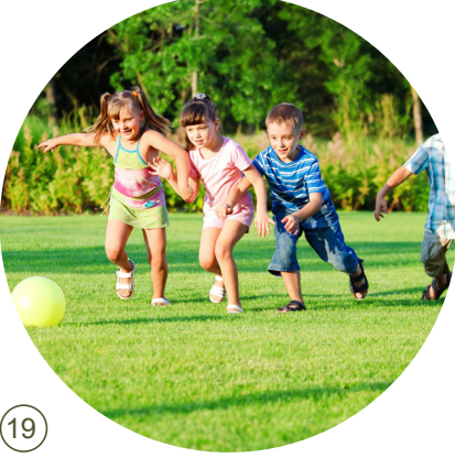
Kick Around Lawn