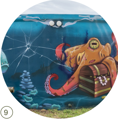
9 Local Artist Artworks to Existing Tank