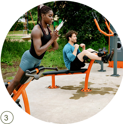
3 Upgraded Fitness Nodes