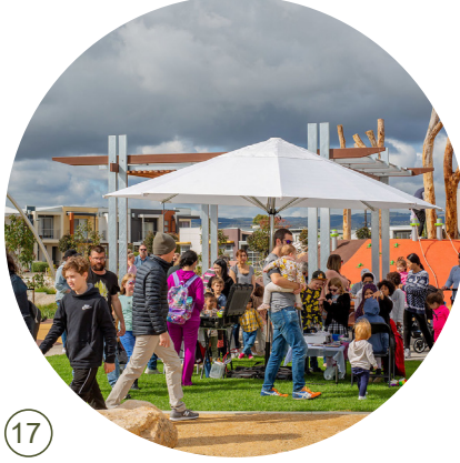
17 Community Pop-Up Events Area