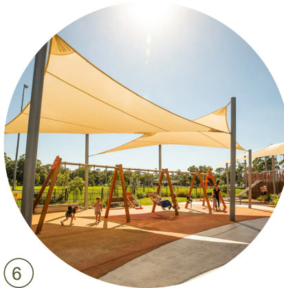
6 Toddlers and Young Kids Playspace with Shade Sails