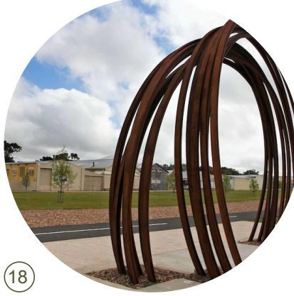
18 Rail Themed Artwork Pieces