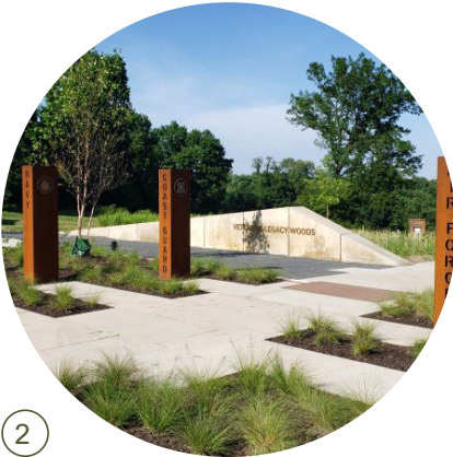
2 New Gateway Plaza with Feature Gardens and Artwork