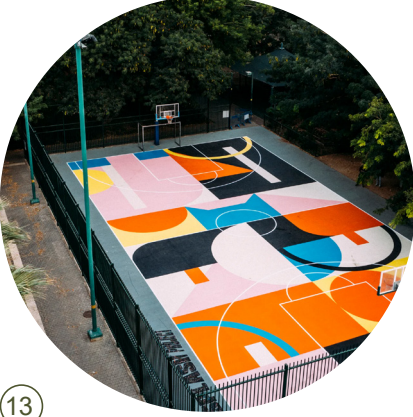
13 Multi sport Courts with Surface Artwork