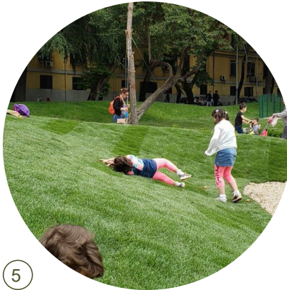
5 Relaxation Mound